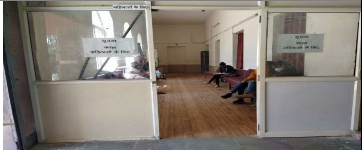
Interior of Girl's Common Room With Seating Arrangement & Water Cooler