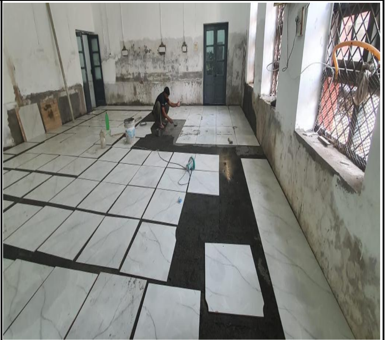
Building Repairing Photographs