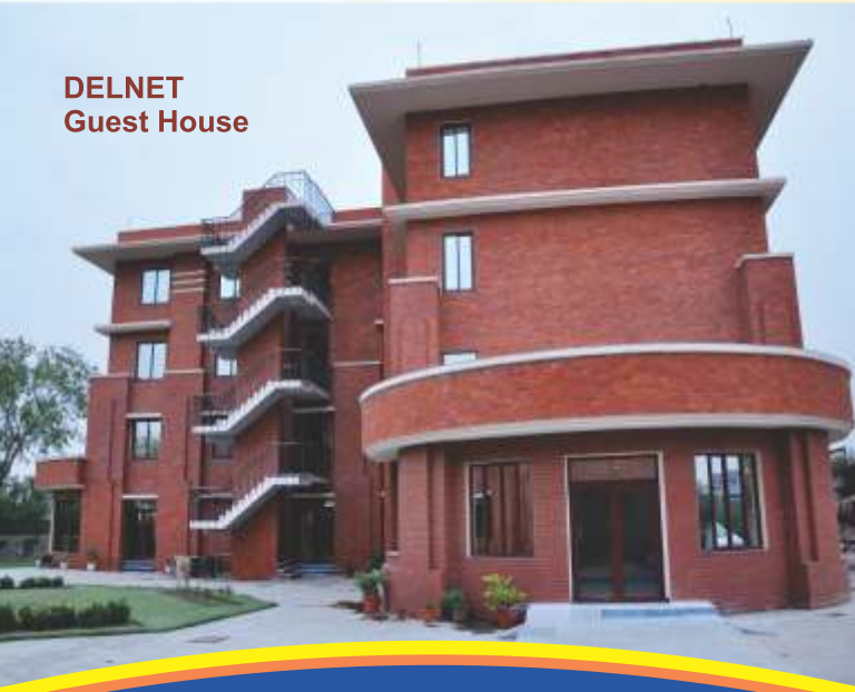
DELNET Guest House

For a new membership, the payment of ₹19,470/- may kindly be sent through a DD to be drawn in favour of “DELNET” and payable at New Delhi. Payment can also be sent through NEFT/Netbanking/IMPS/UPI, etc. Please note that the DELNET membership is valid for 365 days from the date of activation and needs to be renewed annually by making a payment of ₹13570 to DELNET.